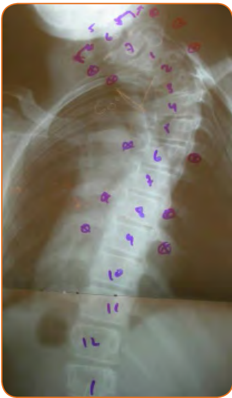
Frontal X-Ray view

Pre-operative assessment for associated congenital abnormalities was negative.